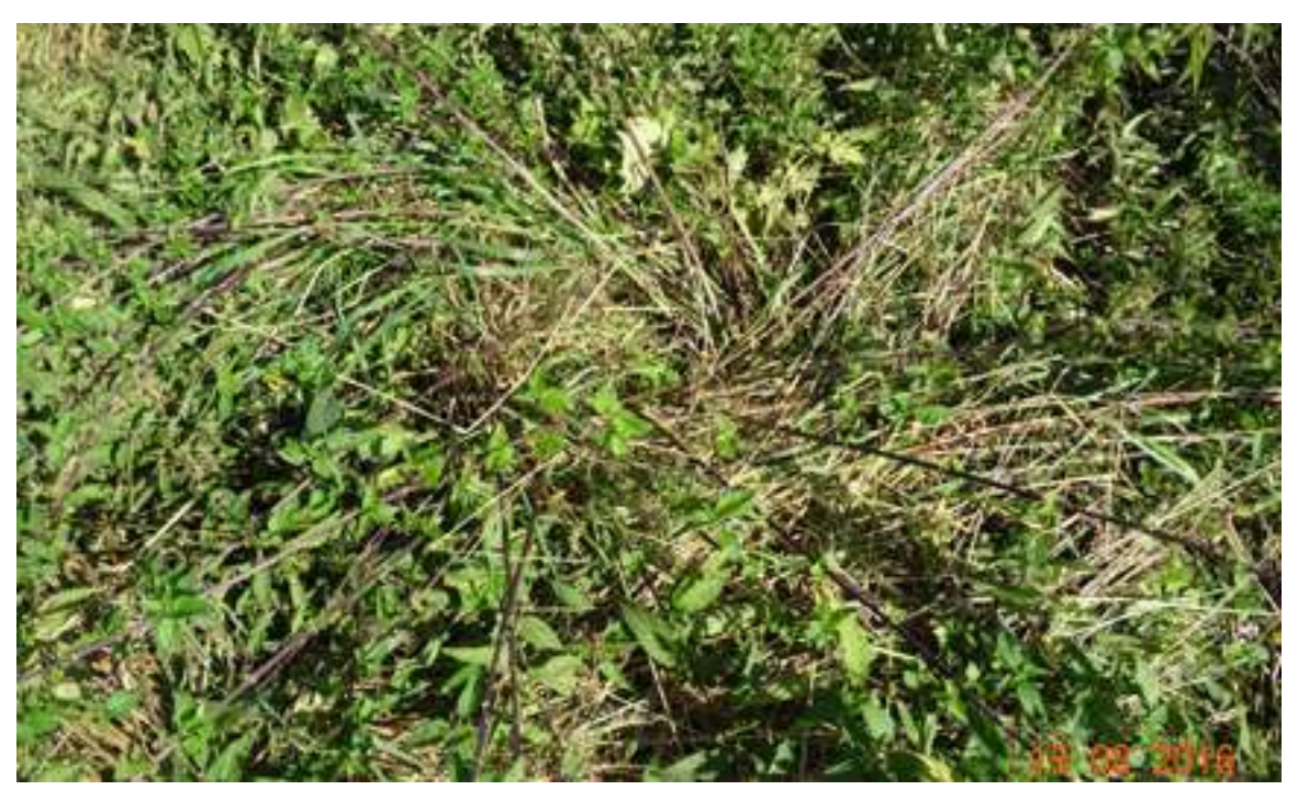
Circle #1 formed around a clump of thick-stemmed nettles, which were splayed radially outward into other wild plants & grasses.

Robbert had to walk carefully around this circle because it had formed around thick-stemmed nettles which have sharp barbs along their stems which are painful if touched (notice Astrid is wearing gloves in close-up photos she took the next morning).