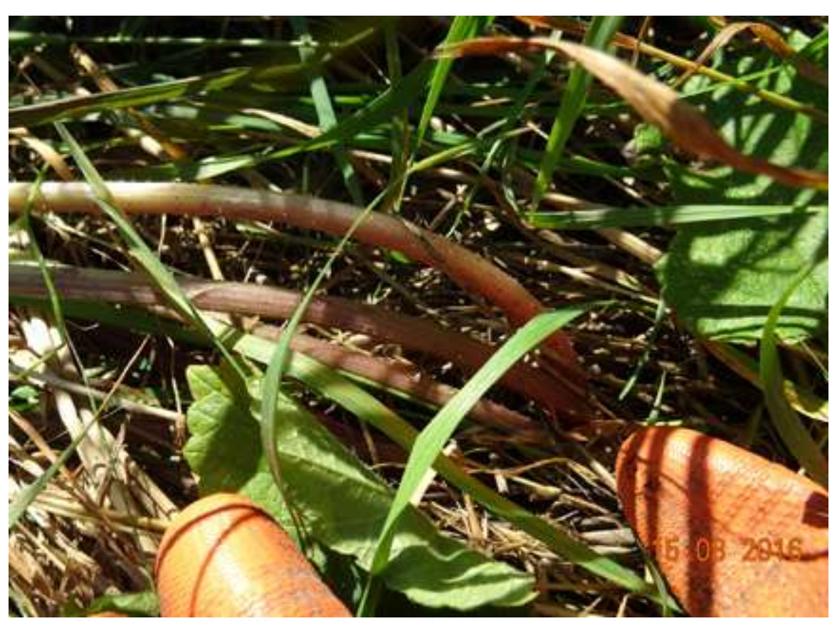
Photographer Astrid Wevers-grims is wearing gloves as she works to get close-up shots of bent nettles in Circle #1.

When this kind of bending is documented in thick-stemmed plants within hours of a circle forming (without concurrent breakage), the stem bending is caused by the heat-producing energy component (microwave radiation) of the circle-creating energy complex (<a href="http://www.bltresearch.com/published/physics.html">http://www.bltresearch.com/published/physics.html</a>) instantly heating up the plants' internal moisture to steam--thus softening both the stems' internal and external fibers so the plants can be flattened without breakage of the normally rigid stems.