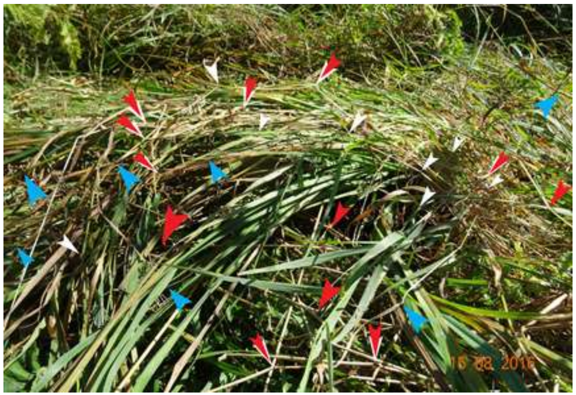
Red arrows indicate elongated nodes ; blue arrows point to expulsion cavities (holes blown out at the stem nodes); white arrows indicate downward bending nodes .

In ALL of these circles which included wild grains of varities examined by BLT in hundreds of genuine crop circles from multiple countries over the years, clear elongated nodes and expulsion cavities —the two scientifically-documented VISIBLE plant changes known to be caused by the not-fully-understood circle-making energy complex (<a href="http://www.bltresearch.com/plantab.php">http://www.bltresearch.com/plantab.php</a>) in BLT's published papers (<a href="http://www.bltresearch.com/published.php">http://www.bltresearch.com/published.php</a>) were present— as well as downward-bending plant stem nodes (rather than upwardly bent, the natural attempt of plants to reoirient to sunlight, called "phototropism"). The presence of thick-stemmed weeds bent in circular swirls, without breakage, is another clear indication that these "messy" circles—created by "laser-like" light beams emanating from visible light-balls—were in fact the real McCoy.