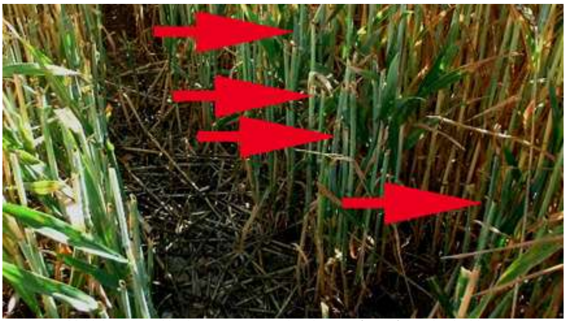
Multiple cuts and broken stems around perimeter of crop formation inside a standing section of plants inside a crop circle.

BLT's peer-reviewed and published (<a href="http://www.bltresearch.com/published.php">http://www.bltresearch.com/published.php</a>) findings consistently emphasize the fact that overall "geometric" design and tightly-flattened, symmetrical lays within precise perimeters are not proven indicators of authenticity. W.C. Levengood's 1994 crop circle paper featured a decidedly "un-geometric" U.S. formation in which the plant abnormalities proved it was genuine, and the most thoroughly scientifically-evaluated formation to-date known to be real—the 1999 Edmonton, B.C., Canada formation subjected to both Levengood's standard plant and soil tests as well as to x-ray diffraction of clay minerals in its soils (<a href="http://www.bltresearch.com/xrd.php">http://www.bltresearch.com/xrd.php</a>) by additional scientific experts in the XRD technique and in clay mineralogy--had a totally "chaotic" lay.