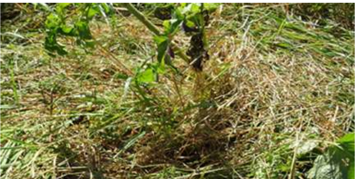
Circle #4 (smaller than #1 & #2) was swirled around a single standing nettle in amongst multiple wild grasses & weeds.