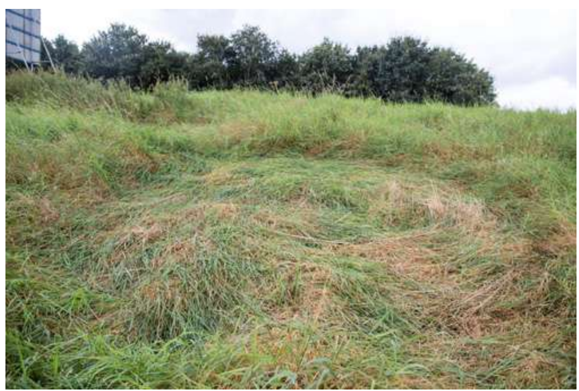
Circle #2, showing generally "fluffy" lay & marked browning of grasses, compared to other circles.

The second circle formed primarily in grasses and it appears that the heat from the "laser-like" light-beams Robbert observed shooting down from the light-balls to the roadside caused considerable drying out and browning of the grass.