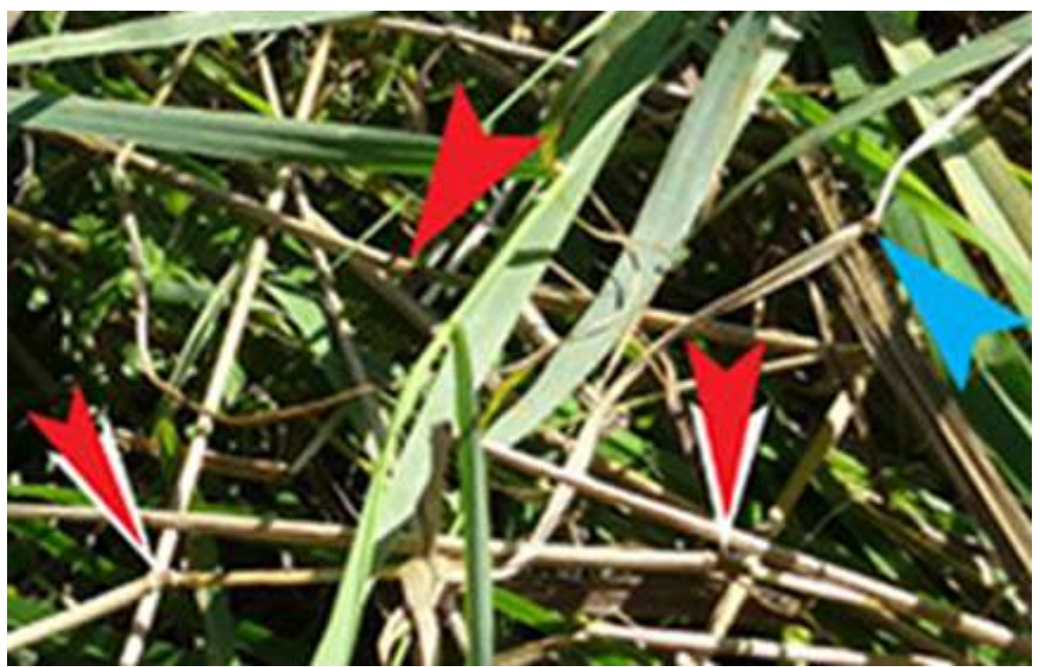
Grains mixed in with wild grasses & nettles show nodes bent downward (white arrows), elongated nodes (red arrows) & expulsion cavities (blue arrows) throughout. (See: http://www.bltresearch.com/plantab.php)

As Robbert walked closer to the edge of the road he saw 4 circles flattened in a line along the side of the slope, overgrown with wild grasses and nettles (which have very sharp spines that sting if touched). He walked carefully down to the circles to feel the energy (which he says was very "gentle") and, when he got to the last circle, was "flabbergasted" as an "electric" discharge of some kind--a bright flash of light--occurred right between his feet. In spite of his sense that this discharge was electrical, he did not FEEL a shock of any kind.