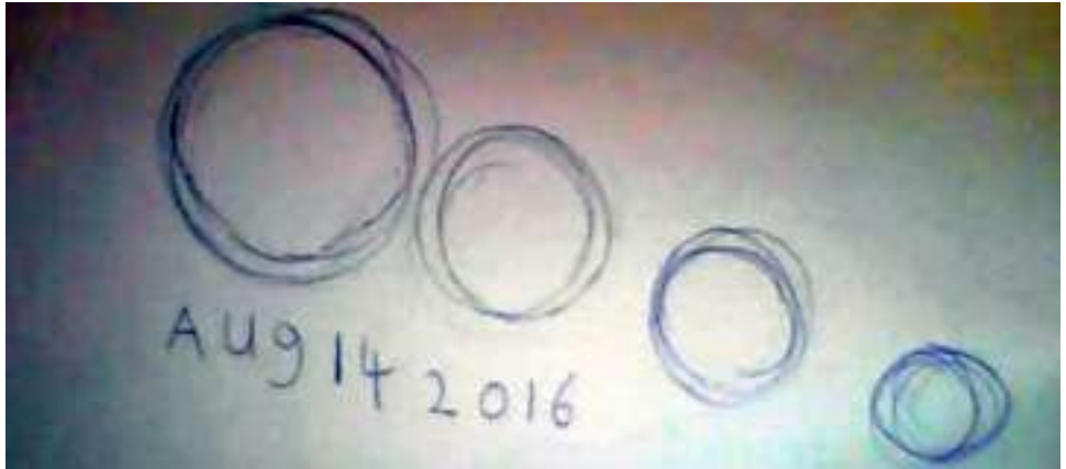
Robbert's drawing of relative sizes & placement of 4 circles created by 4 different-sized BOLS & "laser-like" light beams. (Drone could not be used due to proximity of circles to airport runway.)

At the end of the bridge near the Bosschenhoofd airport and the "Eye" design in planted flowers his motorbike suddenly stopped by itself & he couldn't re-start it. He had began pushing the bike when he saw a big flash of light and 4 light-balls (1 big & 3 smaller ones) suddenly appear, followed by "laser-like light beams" shooting down from the BOLs to the sloping side of the road on his right. He also heard an "electrostatic" type of noise as these light beams hit the ground. Then the light-balls, one by one, just went out & disappeared.