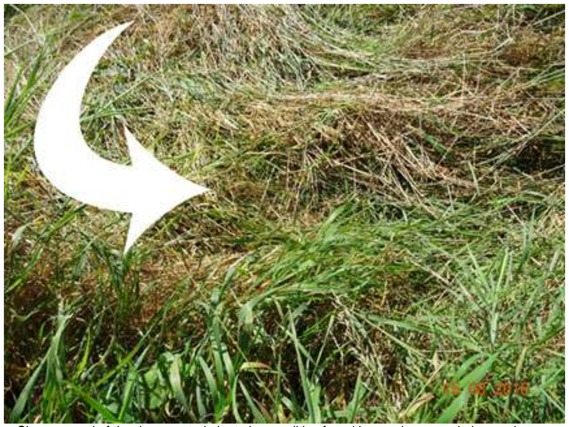
Since several of the documented plant abnormalities found in genuine crop circles are known to be caused by heat, did the "light-beams" dry out the grasses in Circle #2?