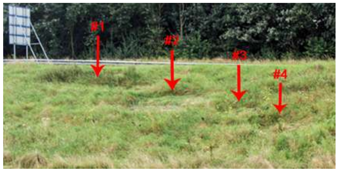
Four circles formed by 4 BOLs shooting light-beams down to ground only meters away, as Robbert pushed his bike along edge of highway.

As Robbert walked closer to the edge of the road he saw 4 circles flattened in a line along the side of the slope, overgrown with wild grasses and nettles (which have very sharp spines that sting if touched). He walked carefully down to the circles to feel the energy (which he says was very "gentle") and, when he got to the last circle, was "flabbergasted" as an "electric" discharge of some kind--a bright flash of light--occurred right between his feet. In spite of his sense that this discharge was electrical, he did not FEEL a shock of any kind.