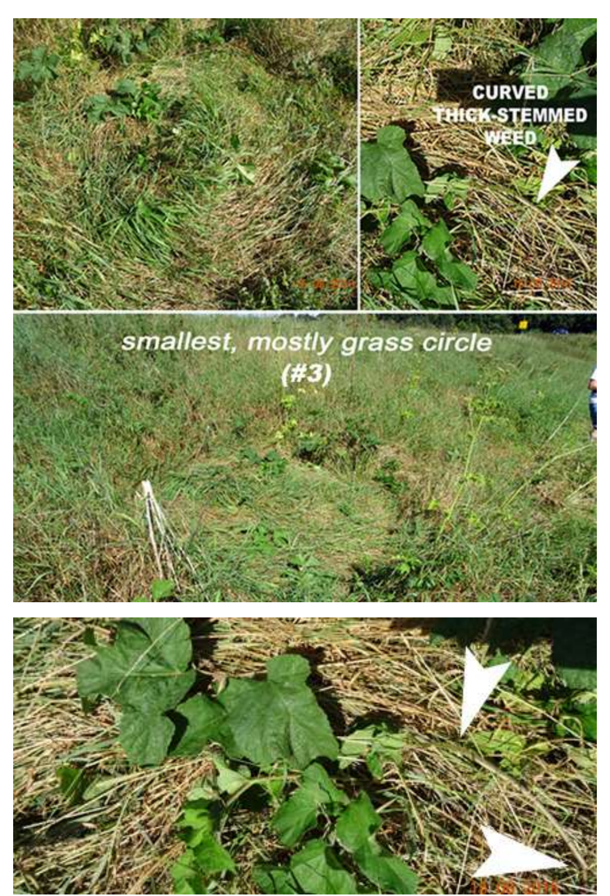
Circle #3 included swirled, thick-stemmed plants along with grasses.