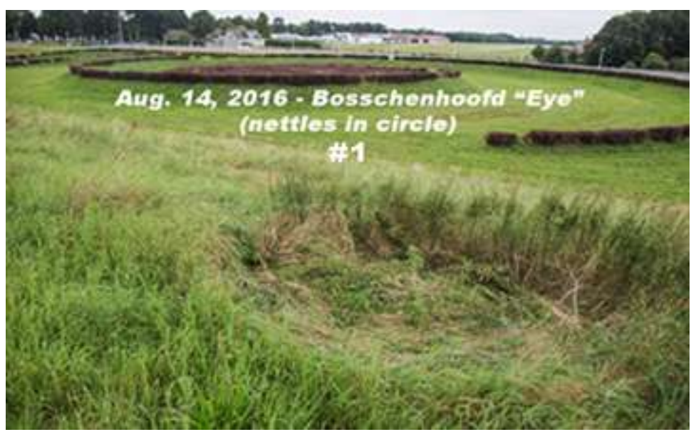
Circle #1 (closest to road) with Bosschenhoofd "Eye" & small local airstrip in background.