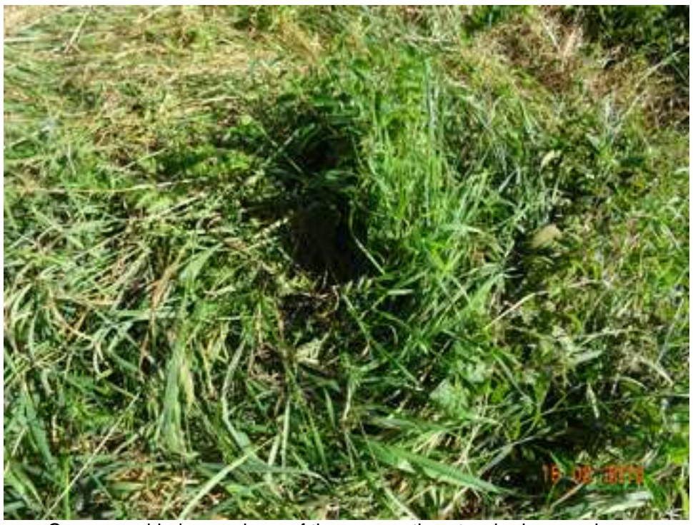
Grasses swirled around one of the apparently untouched green clumps in Circle #2.