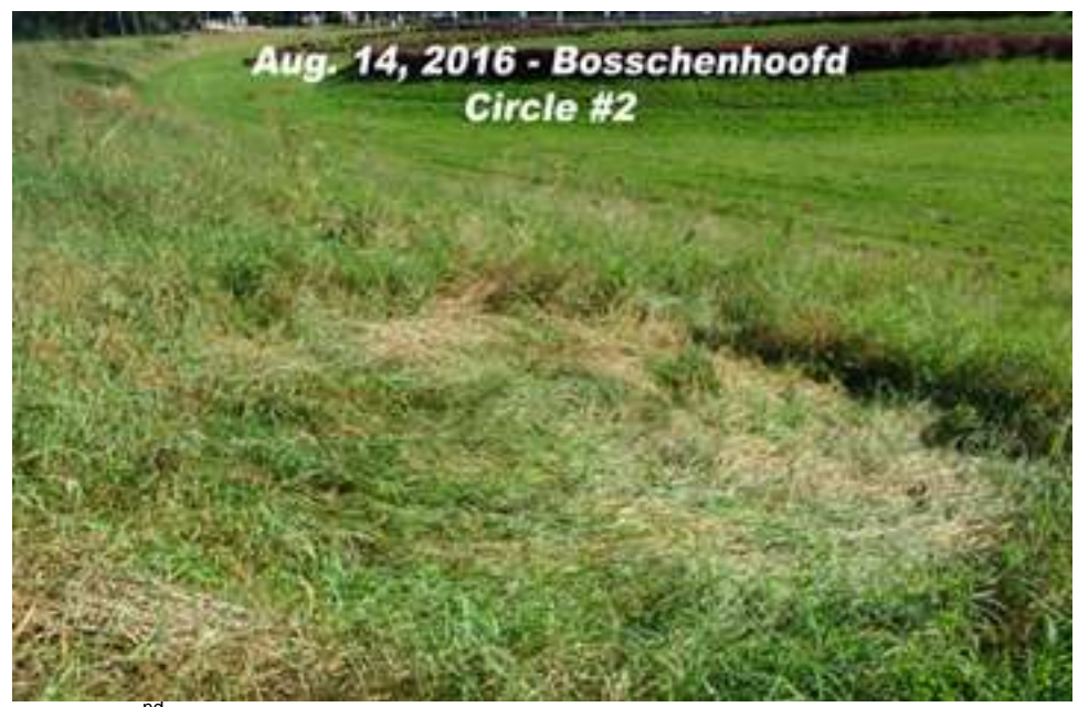
2<sup>nd</sup> circle occurred mostly in grasses & was slightly farther down slope along edge of road.