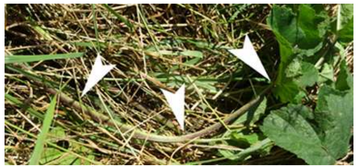
Thick stems of various plants were curved along their entire lengths, mixed in among the other wild grasses & plants.