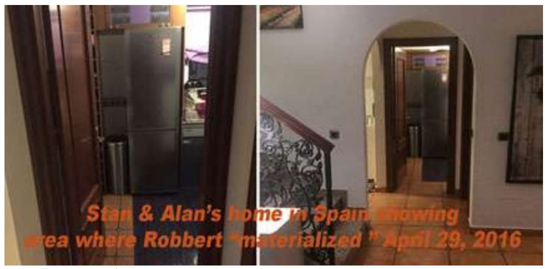
Two views of the area where Robbert appeared taken at my request, so people could see the area as it normally is.