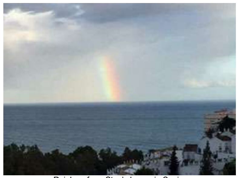
Rainbow from Stan's house in Spain.

https://www.youtube.com/watch?v=K_ejUHOnZug