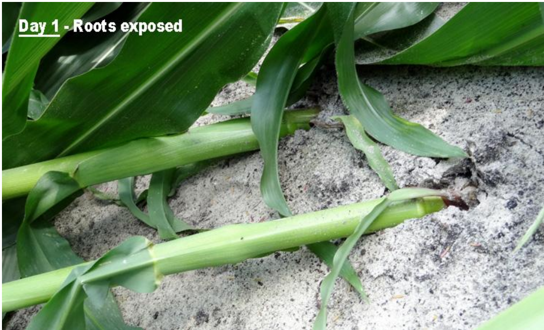
July 16 : The roots of many of the flattened stalks were exposed on Day 1.