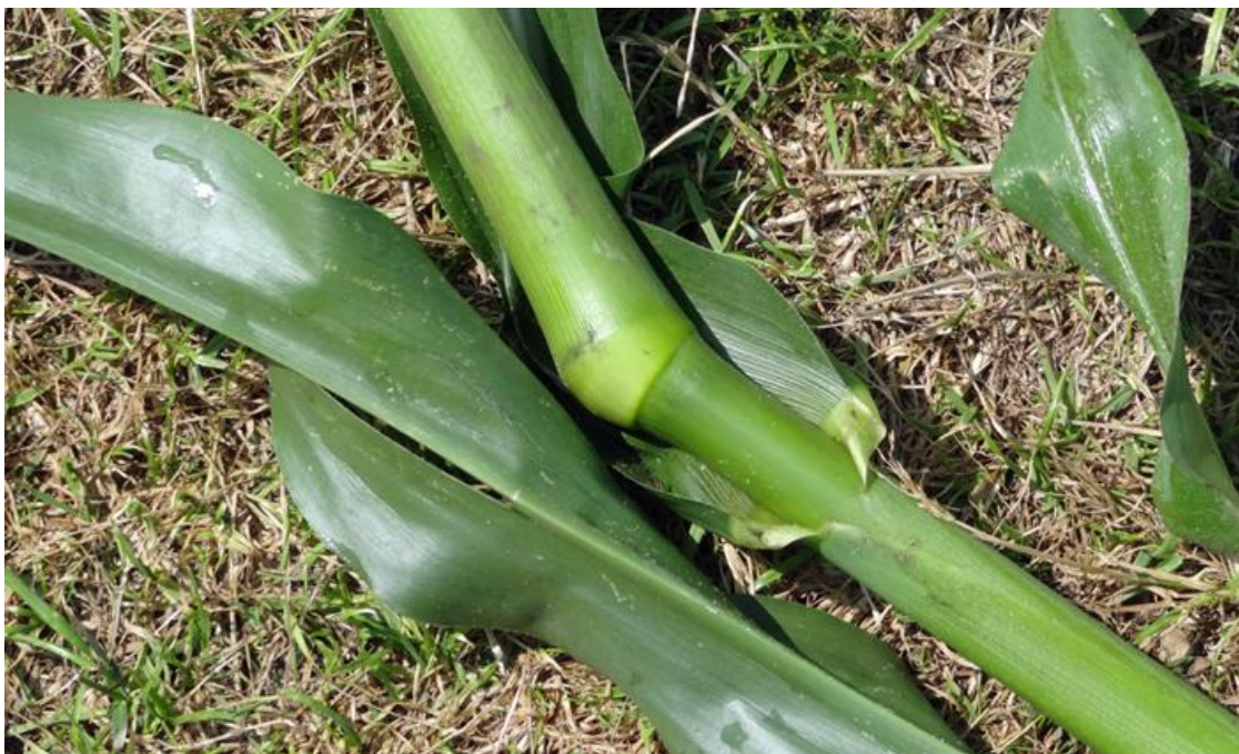
July 22 : Day 5 photos show some node bending, probably partially related to phototropic response, but also to the original circle-making forces.