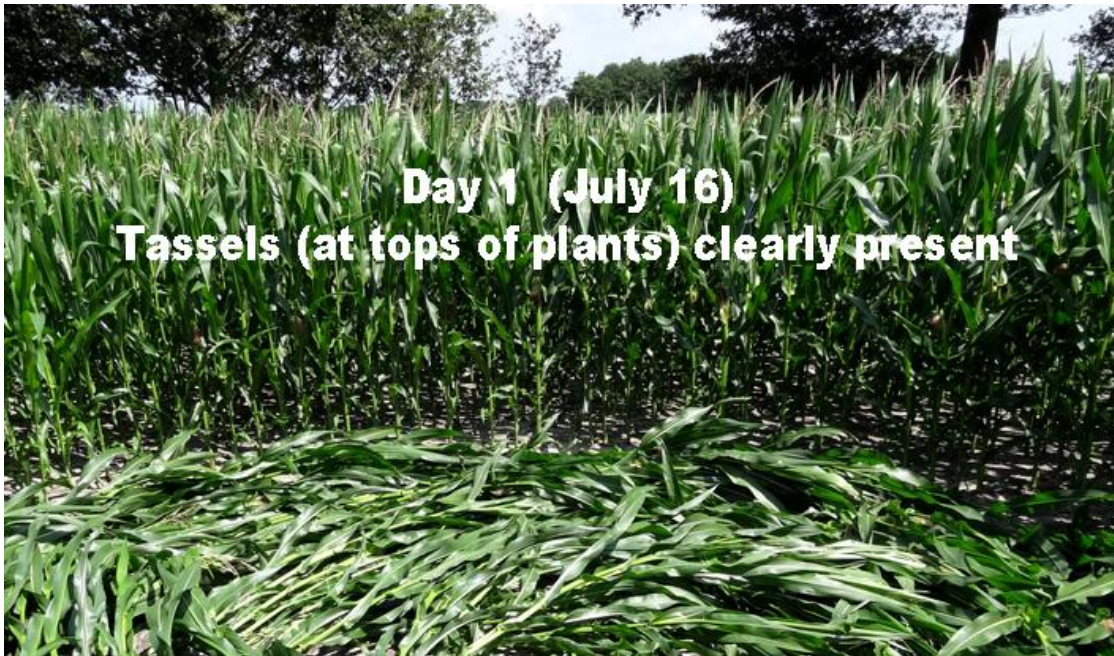
July 16 : Tassels were present on day 1, when maize was flattened, at which growth-stage vertical growth ceases so that cobs can develop.