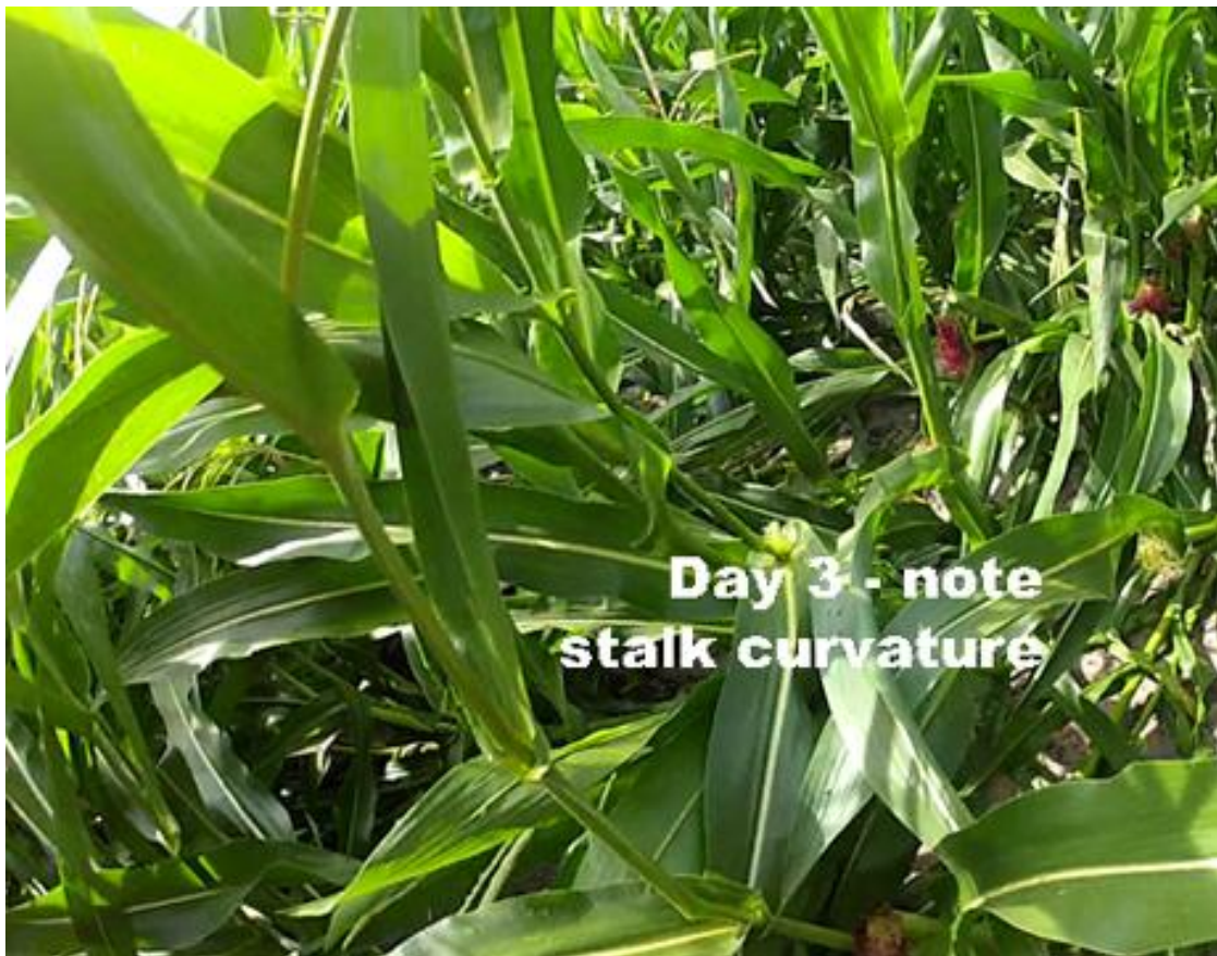
July 19 : Curving maize plants at Day 3.