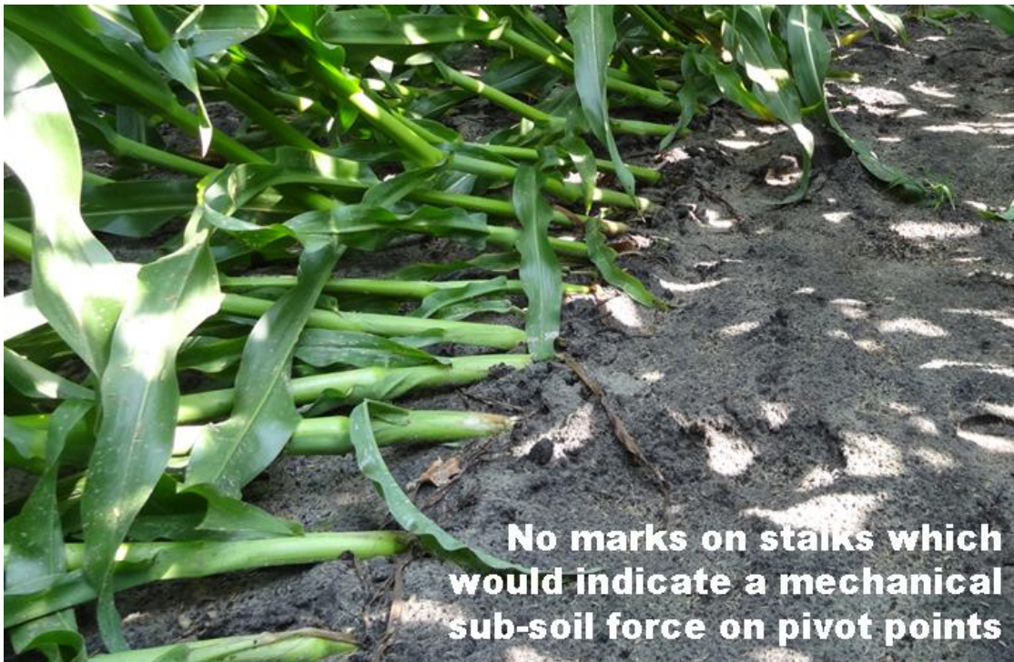
July 22: No bruising or marks to indicate a mechanical force causing pivot points below the soil surface.

Dr. Greub noted that, particularly around the edges and in the center of the circle, the stalks were flattened so that the pivot points were below ground—and that in these relatively large plants with heavy stems at the base, there would have been a lot of weight on the pivot point just below where the stalk emerges from the ground—and yet there were no abrasion marks or stem bruising indicating the application of any mechanical pressure.