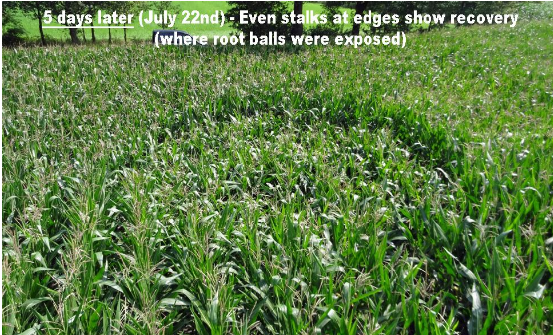
July 22 : At 5 days the July 16 th Etten Leur circle is almost invisible.

To sum up, neither Mr. Erb nor Dr. Greub felt it was likely that phototropism alone could account for all of the recovery present at 3 days in this maize circle. And neither could understand the obvious curvature of the flattened maize stalks on Day 1 nor saw any indication that mechanical pressure was involved in the creation of the circle.