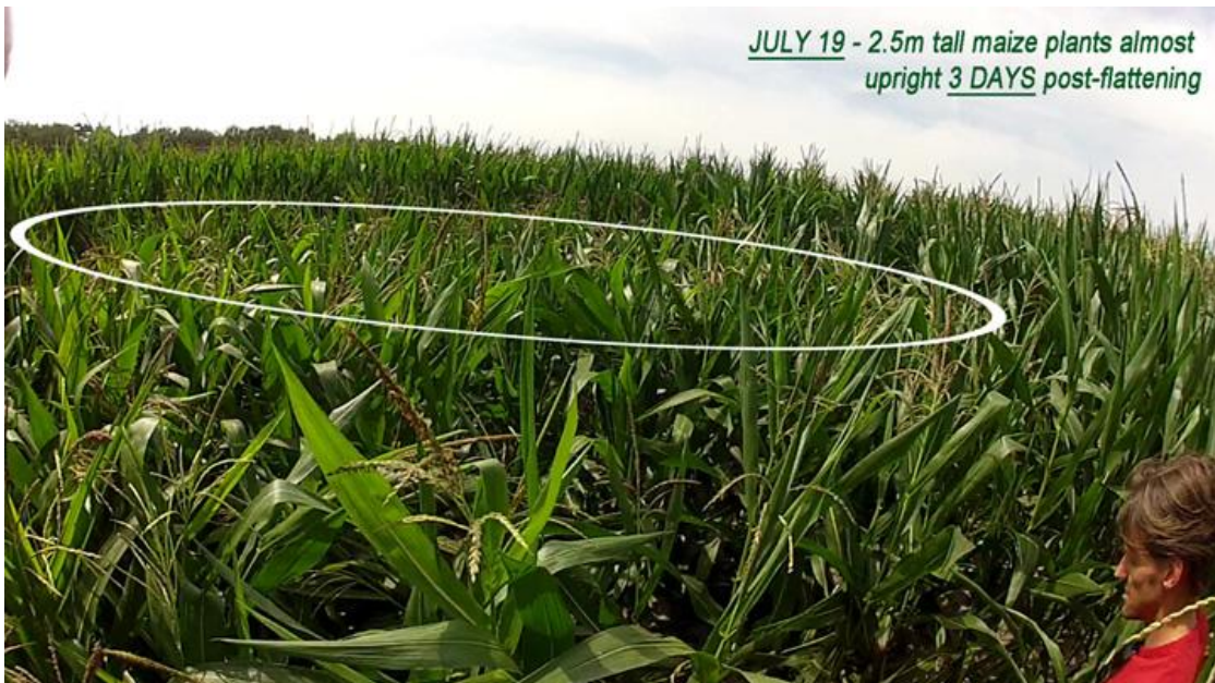
7/19/14 : Very unusual 2.5m tall, tasseled maize plant recovered only 3 days after circle flattened at Etten Leur, Holland.

They were amazed to see that the circle plants had almost completely re-oriented themselves, something that has never—to my knowledge—been observed before in a maize circle. Photo below was taken from the ground.