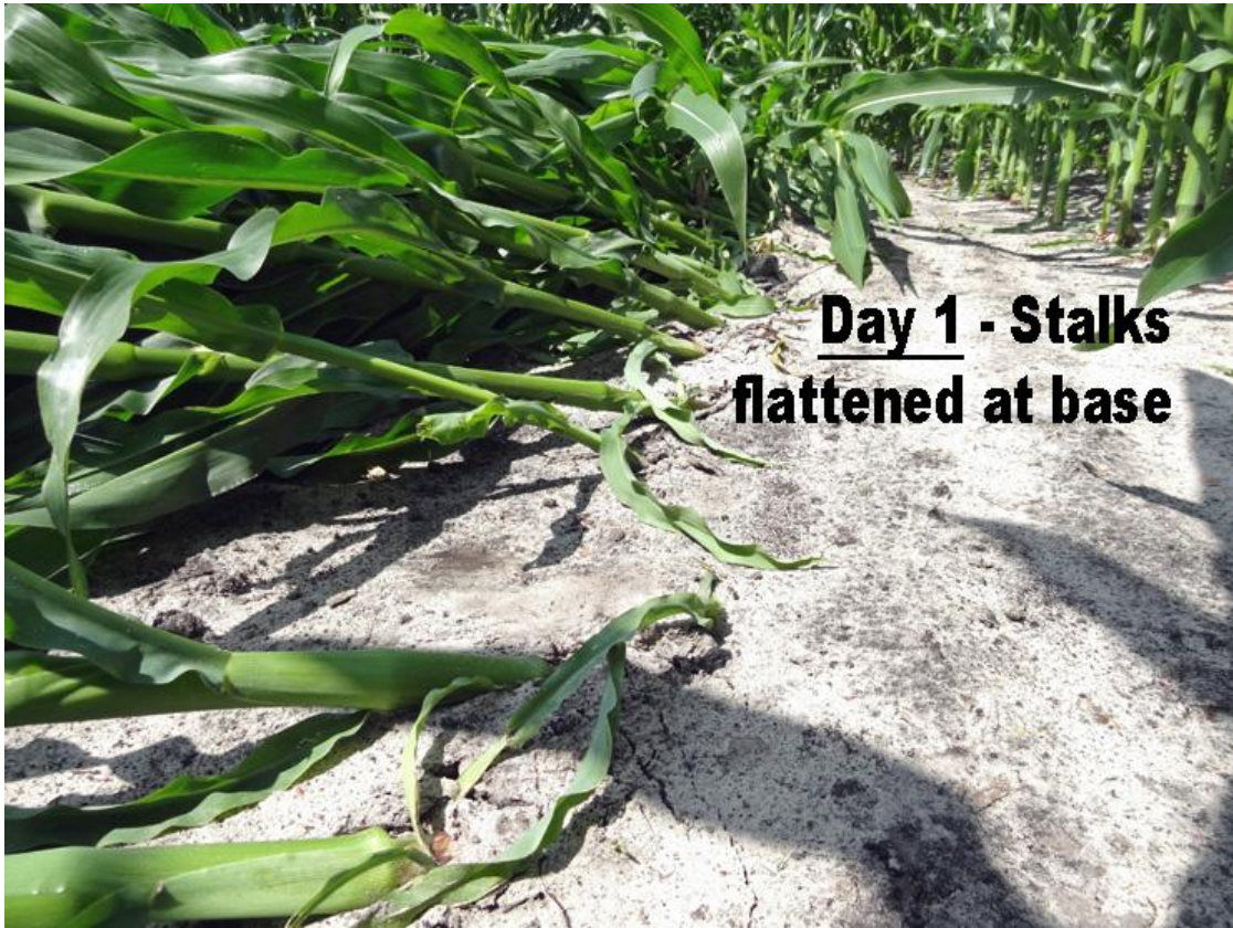
July 16 : Maize plants along the edges of circle are clearly flattened at their bases.