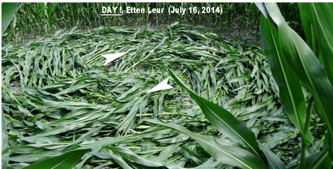
7/16/14 : Maize stalks were flattened and curved into 7m-diameter circle, with no bruising or scrape marks on plants.