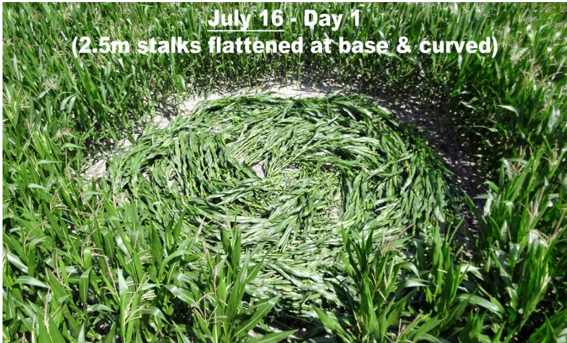
7/16/14 : Roy returned to field after daylight to take photos, only hours after circle formed—the 2.5m-tall corn stalks were laid quite flat.

Also, the maize had reached the pollination stage, when vertical growth stops so the plants' energy can be directed into the development of the cobs.