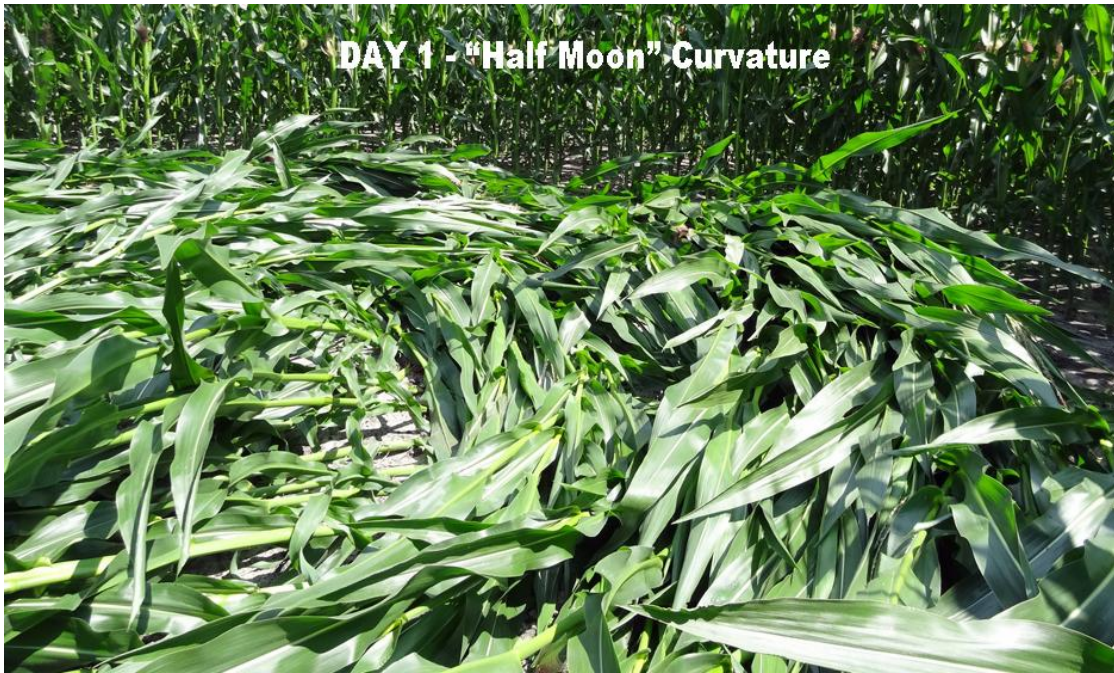
July 16: Day 1 & the well-developed maize plants are clearly curved to create the circle.

Dr. Greub noted that, particularly around the edges and in the center of the circle, the stalks were flattened so that the pivot points were below ground—and that in these relatively large plants with heavy stems at the base, there would have been a lot of weight on the pivot point just below where the stalk emerges from the ground—and yet there were no abrasion marks or stem bruising indicating the application of any mechanical pressure.