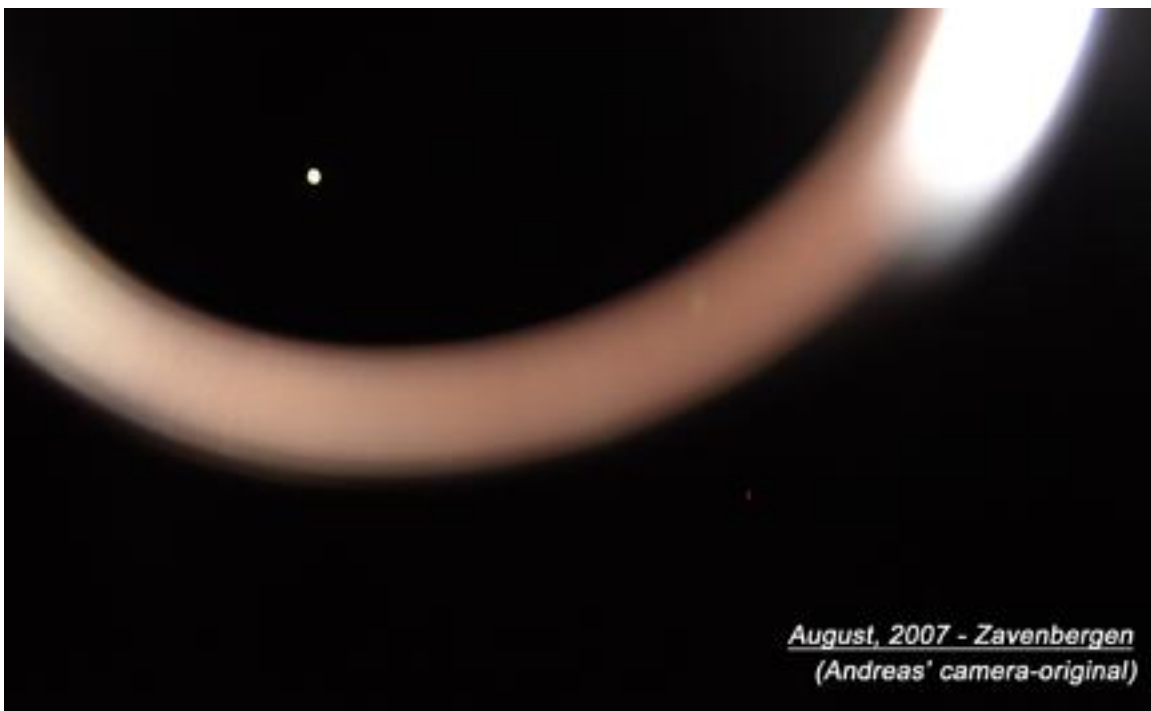
Light ring Robbert had photographed in the field in 2007, using Andreas' camera. (Small dot in photo is the moon.)