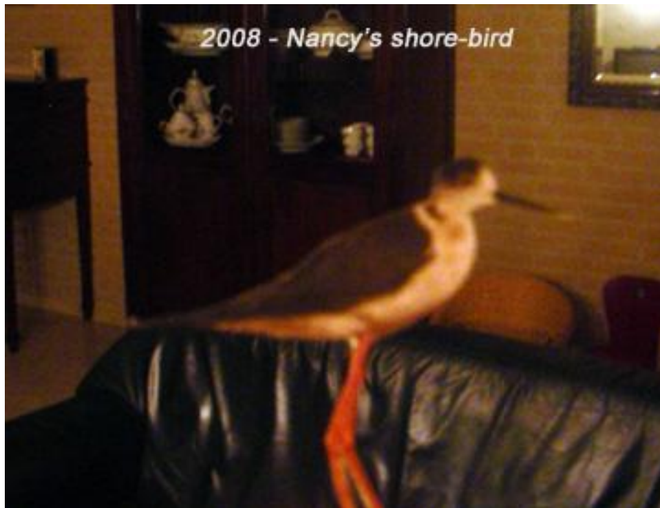
What looks very much like a “Greater Yellowlegs” appears in photo immediately after Nancy says she likes “shore birds.”

A few minutes before, Robbert had taken a couple of shots of Stan and me in the kitchen and, as we had so often observed in the past when anomalous photos were going to appear, those first photos (see above) were abnormally yellowish or amber in color, and “fuzzed” as if out-of-focus. My camera was set in “auto” as it always is and these effects never occur except when inexplicable images are subsequently going to appear.